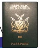
Valid Green Namibian Passport