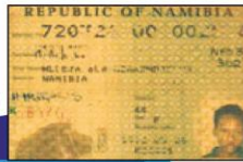
Old Namibian Identity Document